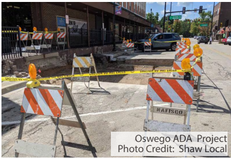
Oswego ADA Project