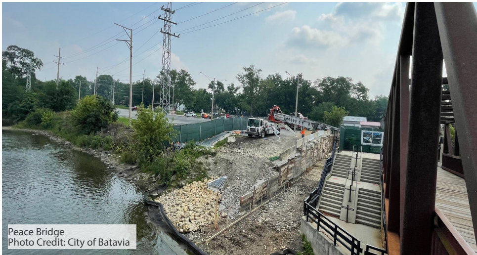
Peace Bridge