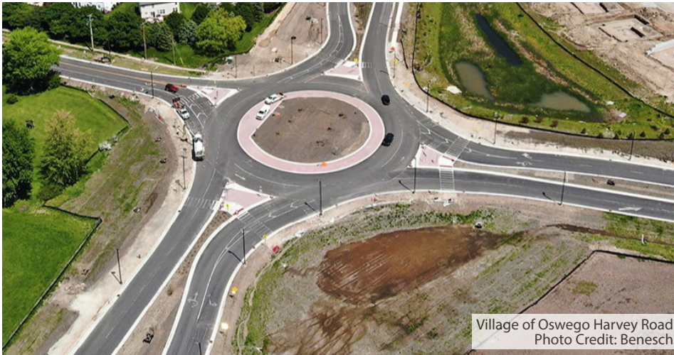
Village of Oswego Harvey Road