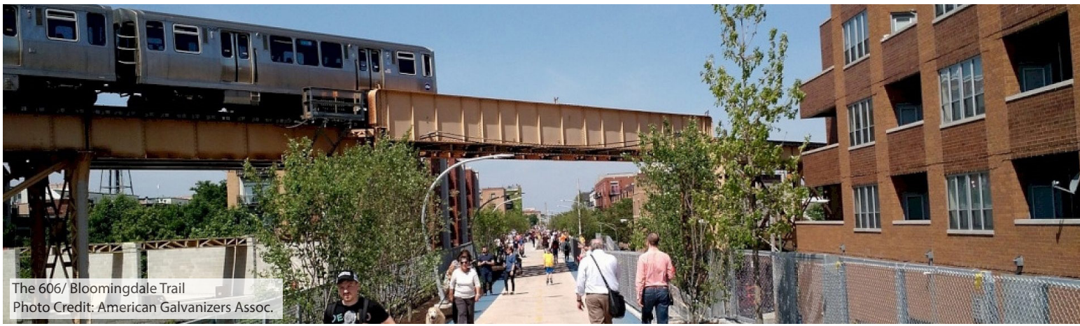
The 606/ Bloomingdale Trail