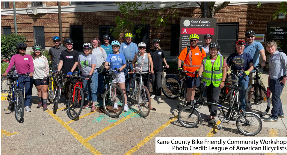
Kane County Bike Friendly Community Workshop