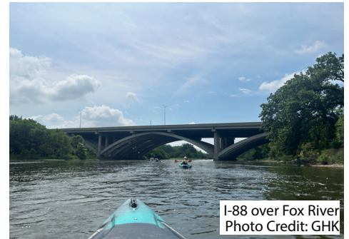
I-88 over Fox River