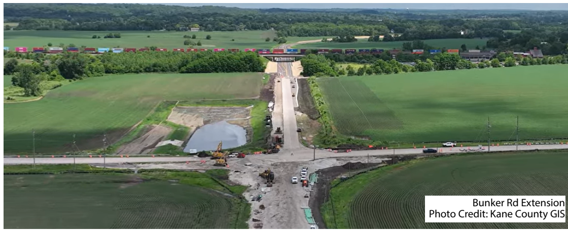
Bunker Rd Extension