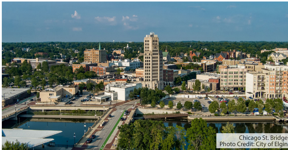
Chicago St. Bridge