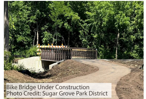
Bike Bridge Under Construction