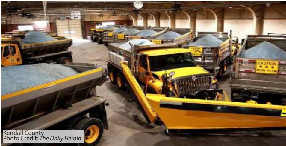
Kendall County