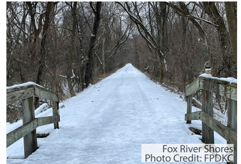
Fox River Shores